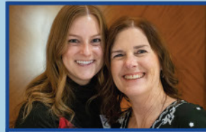
Our chapter's FABULOUS administrator and her guest