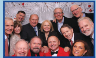
Past presidents- too many to name, were ready to party at the always excellent Holiday Party!