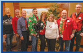
Rotarians and guests showed their holiday spirit!