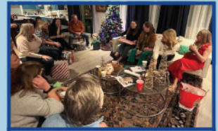
The last 25 Club meeting of the year