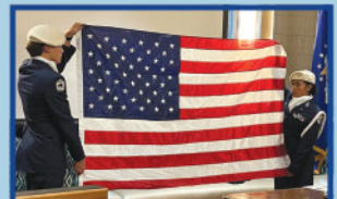
Palo Verde HS Jr ROTC presented the folding of the flag