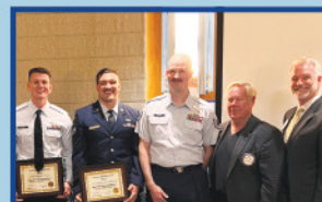
Wetzel Award Recipients