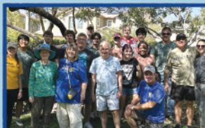
Club members family members and Palo Verde students participated in our annual highway clean up