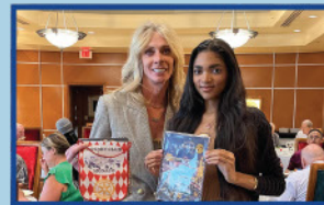
Welcoming a Visiting Rotarian with a Club Banner for Monaco.