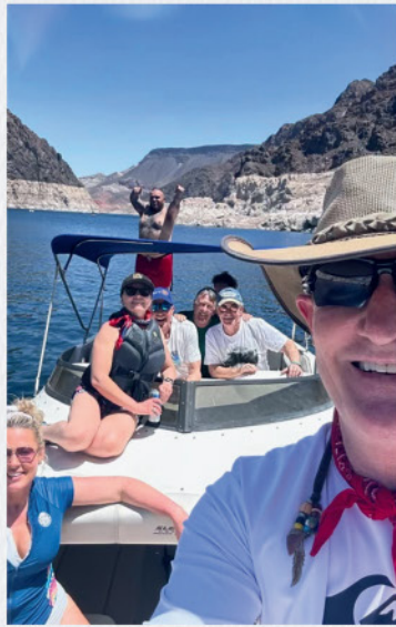
Water Fun After the Lake Mead Clean Up.