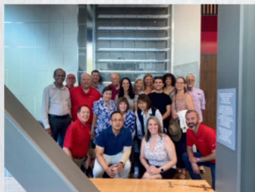
Rotarians, Friends and Family at the VIP Tour of the New UNLV Engineering Building.