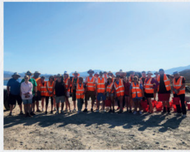
Dedicated Rotarians, Guests and Family at the Lake Mead Clean Up.