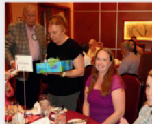
Brocken Elementary School Received a Gift from the LVRC for Being Selected a Top Magnet School.