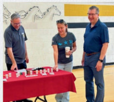
Rotarian Volunteers for Mad City Money.