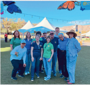
Las Vegas Rotarians at Green Our Planet Spring Farmer's Market.