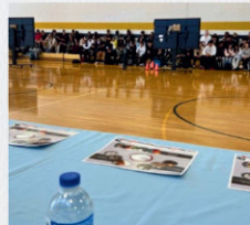
Mad City Money Opening Ceremony.