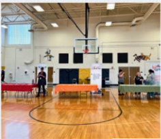
Mad City Money Event at Clark High School.