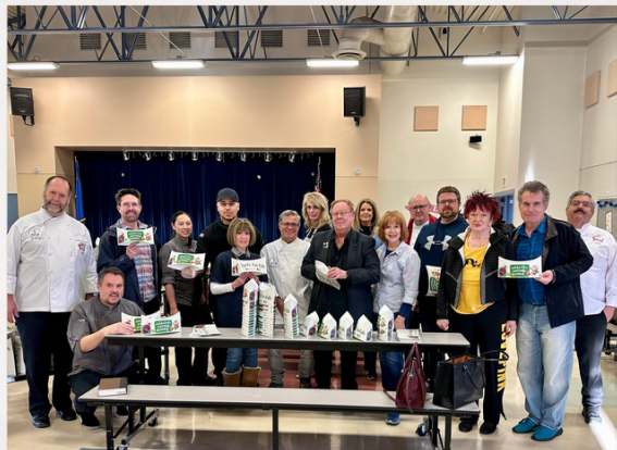
February 2023 Thank You for Volunteering Story Link