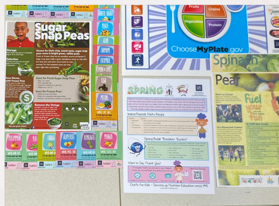
March 2023 Nutrition Education Package