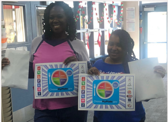
May 2023 Nutrition Education Package