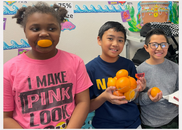
February: Blood Oranges