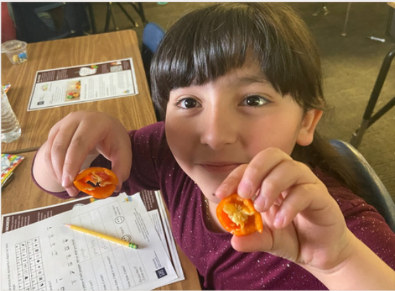
March: Sweet Peppers