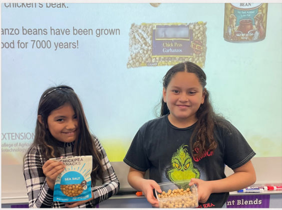
January: Beans & Legumes