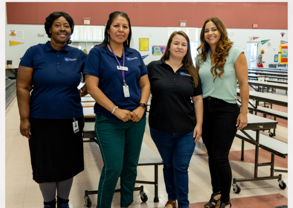
Our nutrition educators