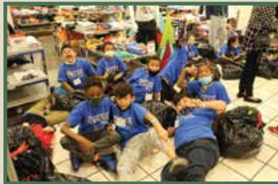
Students from Hollingsworth Elementary enjoying some downtime after a morning of shopping.