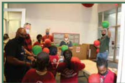
After shopping, the kids enjoyed time at UNLV learning various sports, including golf, football, baseball, soccer and many more.