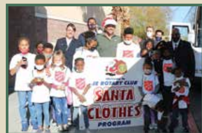
Children from the Salvation Army arrive for the Santa Clothes program.

Since 1996 the total of all the winter clothing, shoes and gifts we provided through the Santa Clothes program exceeds $1,696,696. The total number of children we have served is now 6,345.