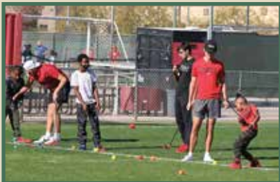
UNLV athletes and the Cheer Squad provided great support.