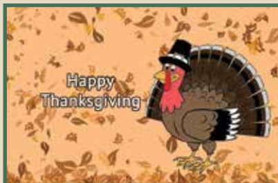
May your Thanksgiving be in the company of friends and family!