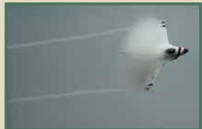
Thunderbirds are back!