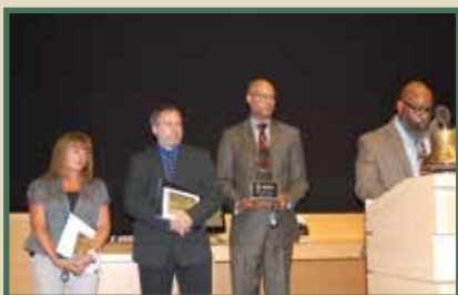
Members of the State Attorney General's office receive a SOAR Award.