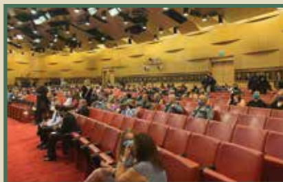
Many in attendance at the SOAR Awards.