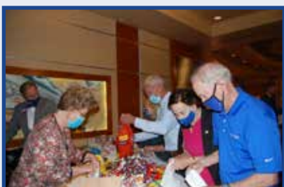
Fabulous Halloween Candy Elves.