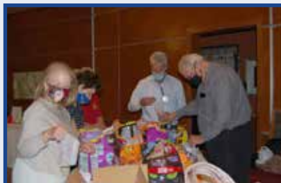
Making Halloween for Bracken Kids.