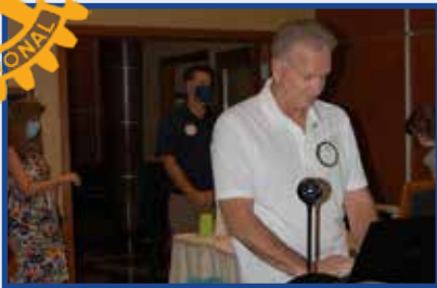
Kirk and Kirk doing things technical.