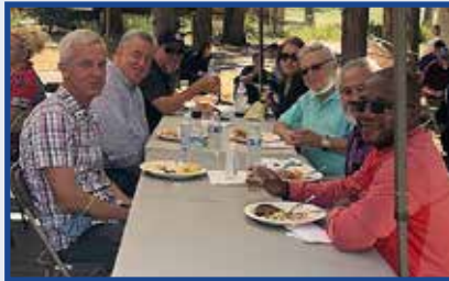
Alpine Picnic 2020 - COVID-19 doesn't stop this group from enjoying the outdoors with plenty of room for social distancing.