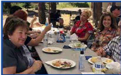
Quite the group enjoying great weather and fellowship.