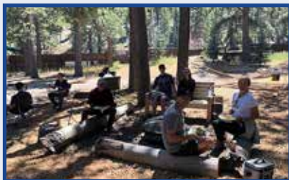
A great group of people enjoying the setting and the food.