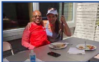
Always smiling, even after a 6 mile hike.