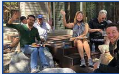
A happy group of hikers back from the trail and enjoying great food.