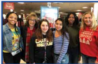
Santa Clothes with Clark Interact Club December 2019