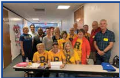
Breakfast with Books October 2019