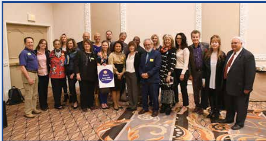
District Peace Conference November 2019