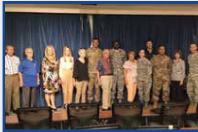
Wetzel Awards September 2019