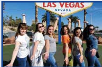
Open World Delegation from Ukraine October 2019