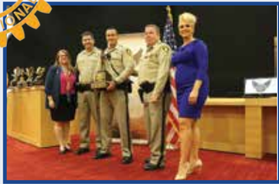
SOAR Awards September 2019