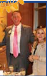
... introduced his ... from Phoenix... ... end is not enough.