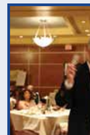
PP Jim K the shot at