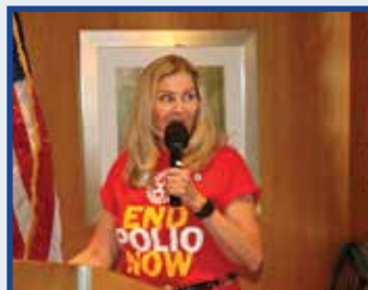
It is that time again...lets load up the Polio Pig for a last push to eradicate Polio.