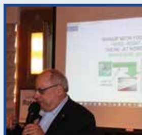
Stu Lipoff's Virtual Green Book for online signups.