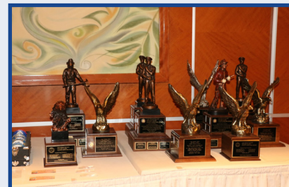
A photo of the SOAR awards to be presented to honor our First Responders; Police, firefighters and emergency personnel.