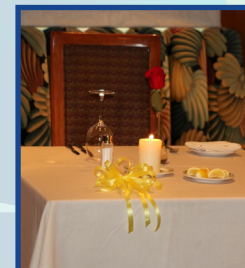
In remembrance of Memorial Day we set up a Missing Man Table.