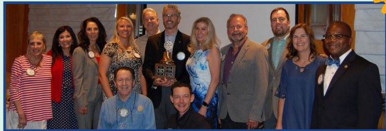
LV Rotary Club wins The Governors Bell for the 2nd year in a row.