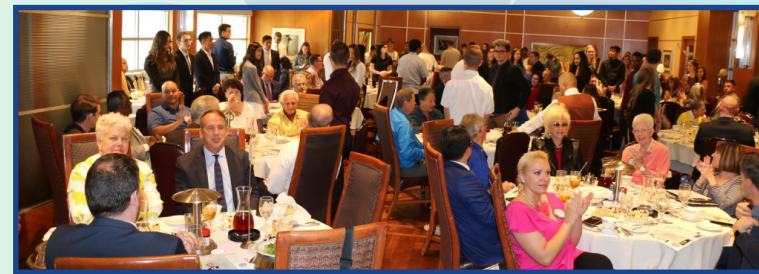
At our Annual Valedictorian Luncheon all of the students stood up and were recognized for their hard work and dedication to gaining knowledge. Each student was recognized individually by school at the podium where they told us of their future plans and were presented with a Fisher Space Pen and a certificate of appreciation.