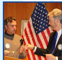
Our visiting Rotarian from Long Beach missed the chance at the Joker.