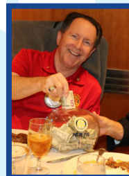
The feeding of the pig otherwise known as the Swiner continues.