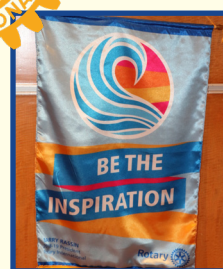
Rotary International's theme for 2018-2019 is "Be the Inspiration".