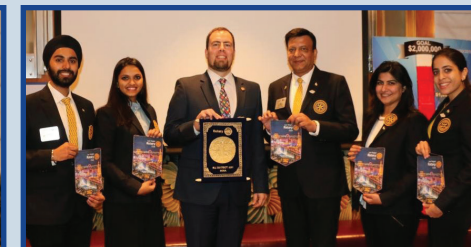
Meet our visiting GCE (Group Cultural Exchange) team from India.