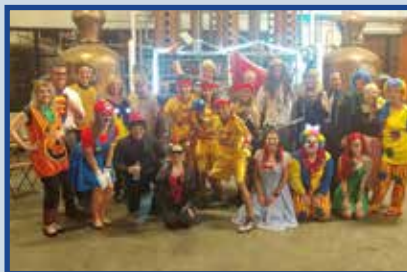
Halloween party 2017.