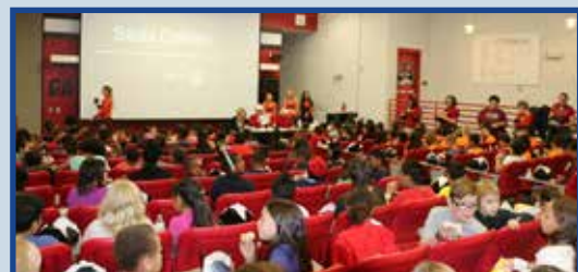
Santa Clothes 2017.