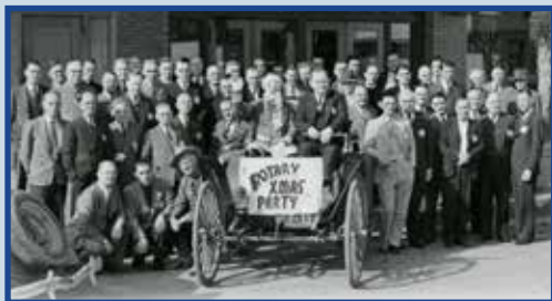
1940 Christmas party.