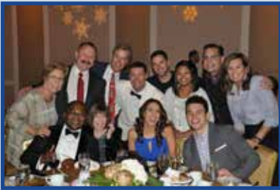
Christmas party 2017.