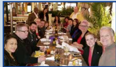
25Club Valentine's Day social.