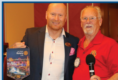
Our international representative exchange banners with Rotarians from Sweden and Italy.