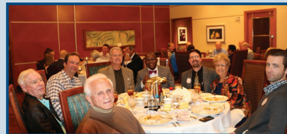
Our birthday members pose for a group picture.