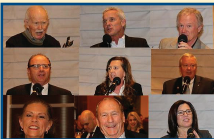
Some of our Club past presidents summarized their year at the Helm.