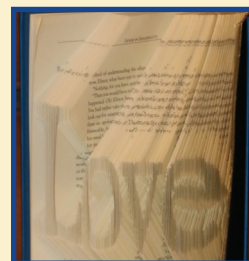
Pam Lang presented the club with a hand folded book presented with LOVE.