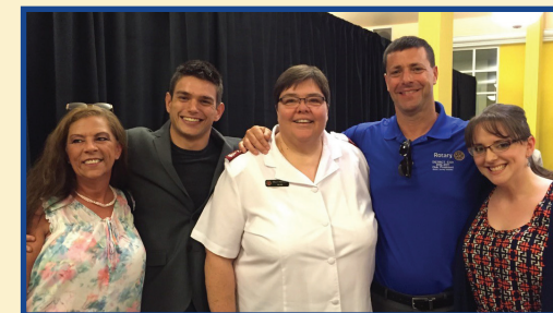
Rotarians support the Salvation Army grand opening event.