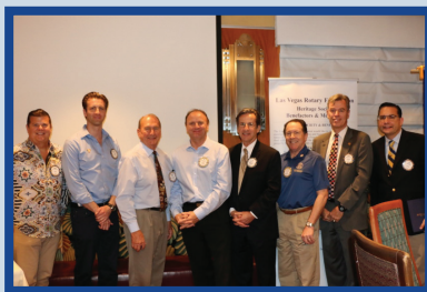
Group picture of this quarter's new Paul Harris and multiple Paul Harris fellows.